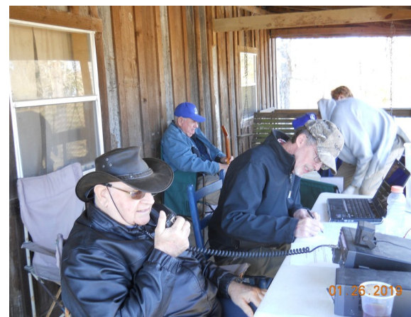
Two operators are making radio contacts at the January 2019 Winter Field Day event in Greenville, Alabama.

Every year, during the 4th full weekend in January and June, amateur radio operators get on the airwaves to see how many stations they can work. It gets radio operators away from their cozy homes and takes them into mobile communication trailers and tents, relying on batteries or solar to power their radio equipment. It is a lot of fun and is very competitive – allowing clubs and individuals to earn coveted awards.